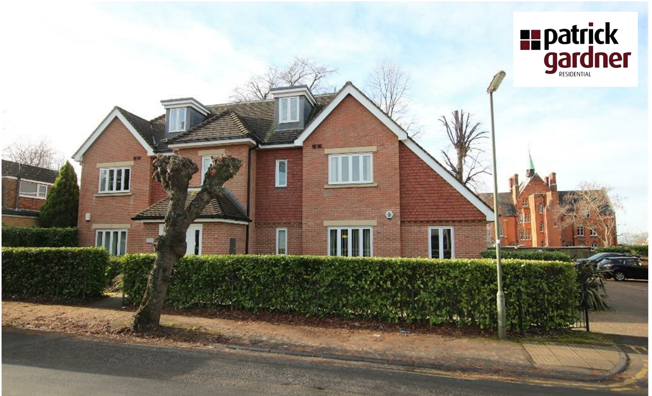
5, Beechwood Court Garlands Road, Leatherhead, KT22 7GL